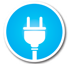
Plug 120V (conv. 240V)*